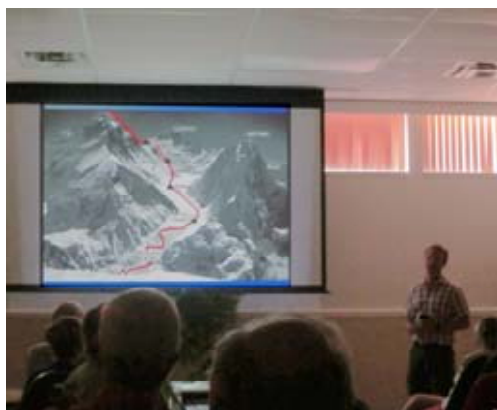
The path to the summit

Angus says he may try for other high mountains someday, but in the meantime he enjoys leading group expeditions to Mount Kilimanjaro.