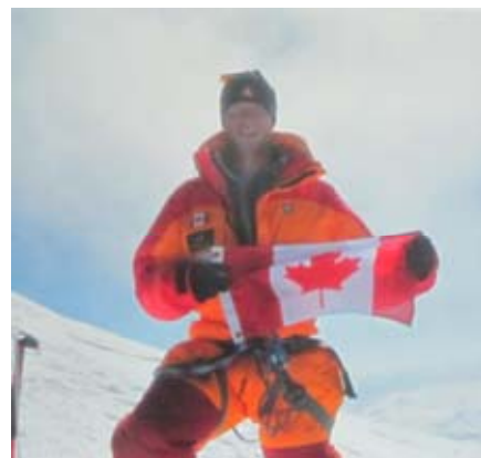
I made it!